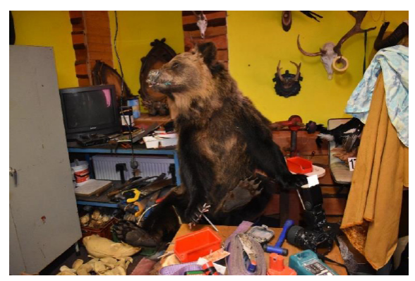
Unfinished brown bear