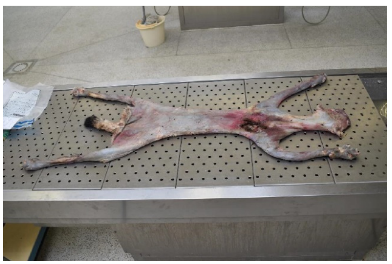
Lynx skin turned upside down