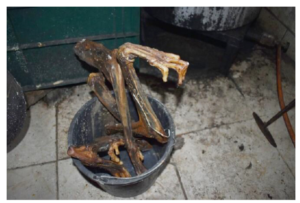
Skinned wolf paws

It is coming to climax when we open the freezers. They are jammed full. Everywhere there are cadavers of animals, some are not protected species – an entire shot dead racoon, foxes, pheasants, wild boars, roe deer. But there are also buzzards, hawks, grouses... Protected animals, which are illegal to kill. There are no documents for anything, the owner literally has none. We find the first lynx, second lynx, wolf, another wolf, elk's legs, bear meat with a sign "brum-brum", an otter, beavers, another otter, again grouses, an eagle owl... We go through a freezer after freezer, and it is unending.