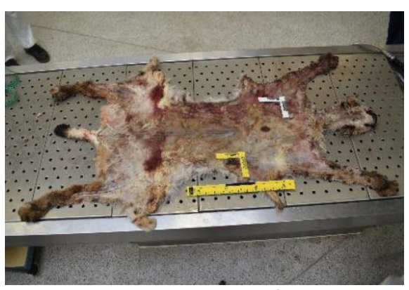
Examination of seized lynx skin

How do we explain to them that exception is related to the word exceptional, there is no legal claim to having it, especially when the hunter is not able to prove that he hunted the animal legally? And how to explain that the hunting of these animals is not in the interest of the public, such that it prevails over the interest of nature conservation (which is the requirement for an exception under the law).