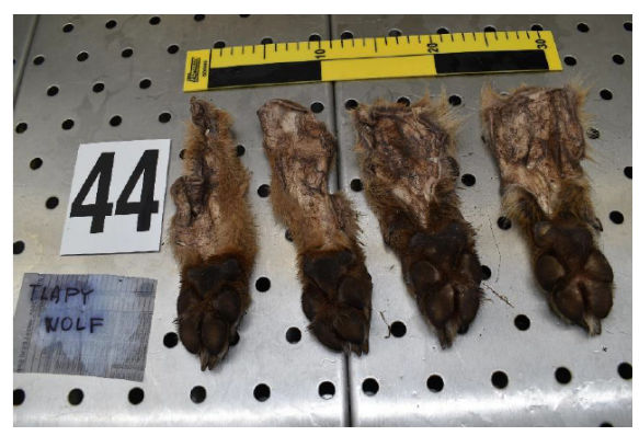
Chopped wolf paws

We are going ahead. A bucket is in the next room, with some kind of ghoulish limbs sticking out of it, without skin and claws. On the first sight they appear to be monkey's hands, but the anatomy of the bones is different when examined carefully – and what would a monkey be doing here? We don't know what it is, so it needs to be seized and given a more detailed analysis (later we learned that these were wolf paws).