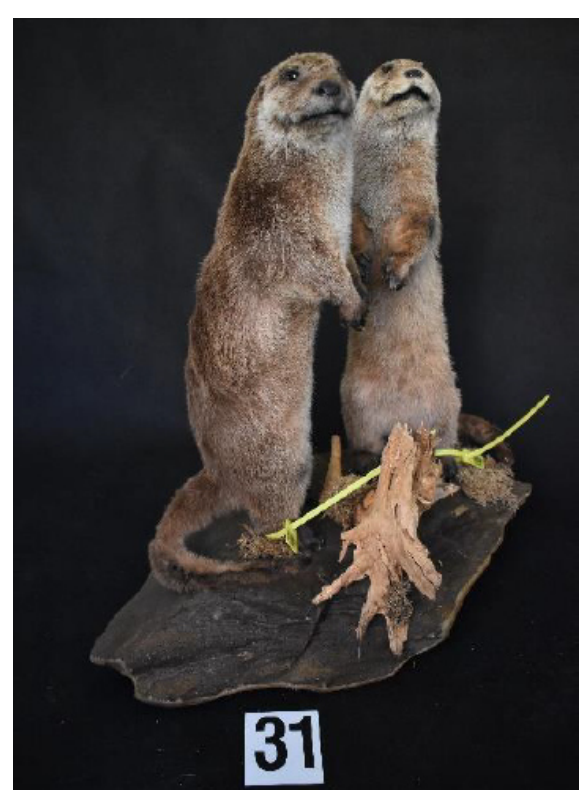
Incarnated "cuteness". Otters' taxidermy from the Operation Hunter

Hunting exotic animals released free in the Czech forest is obviously a hit. The investigation team has a long discussion what to do about it. It is not very clear what shall we do with this information. Fortunately, the situation resolved itself and the planned tiger hunt was not carried out. The supplier of the animals backed out at the last moment as he got a better offer. He obtained an export CITES permit and exported the tigers to Turkey, where they are now in some kind of a facility on the roof of a shopping mall in Istanbul. Probably not a great place for animals, but still better than a caravan covered by corrugated tin and then feeling the bullet of a Slovak hunter.