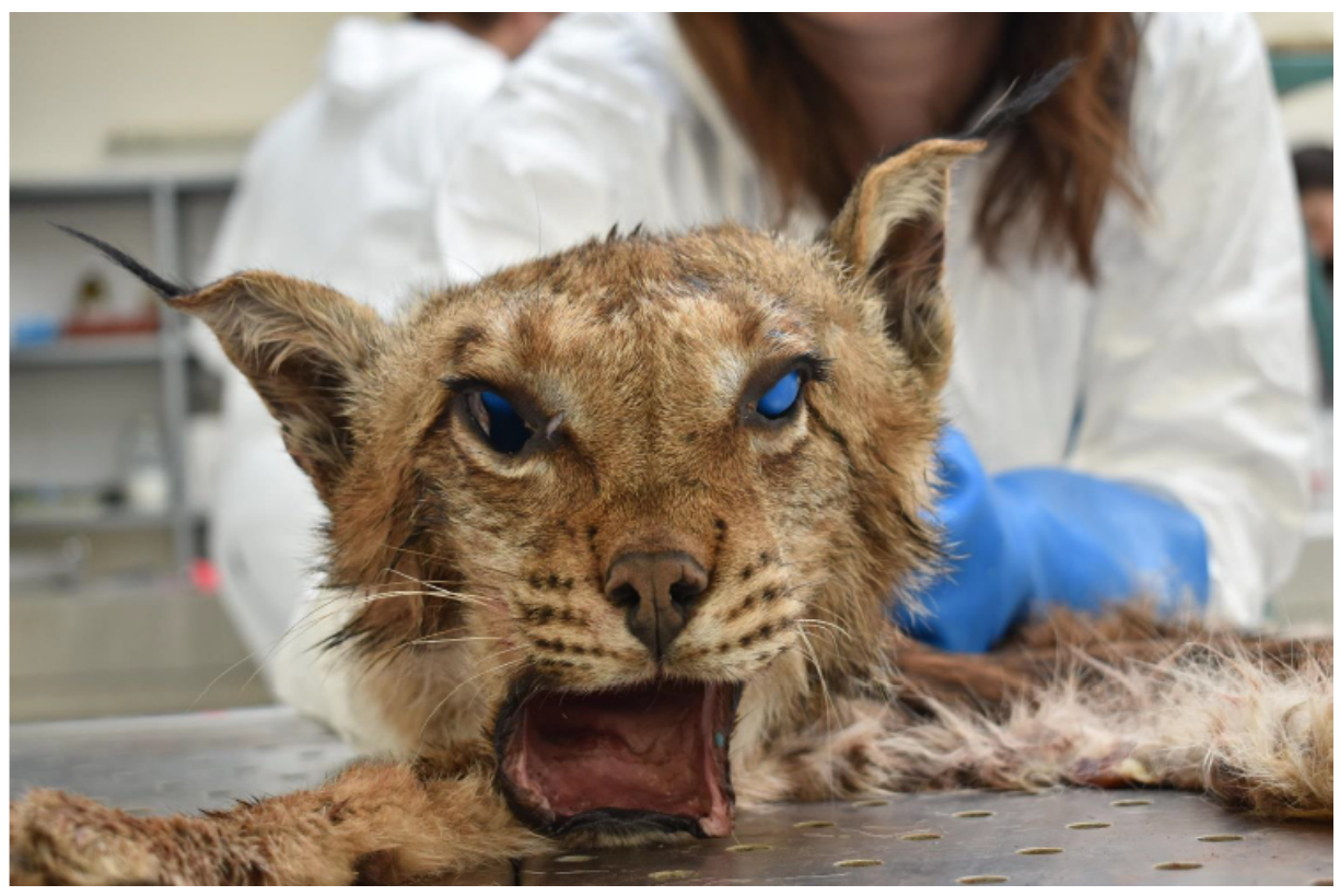
Poached lynx at the autopsy room