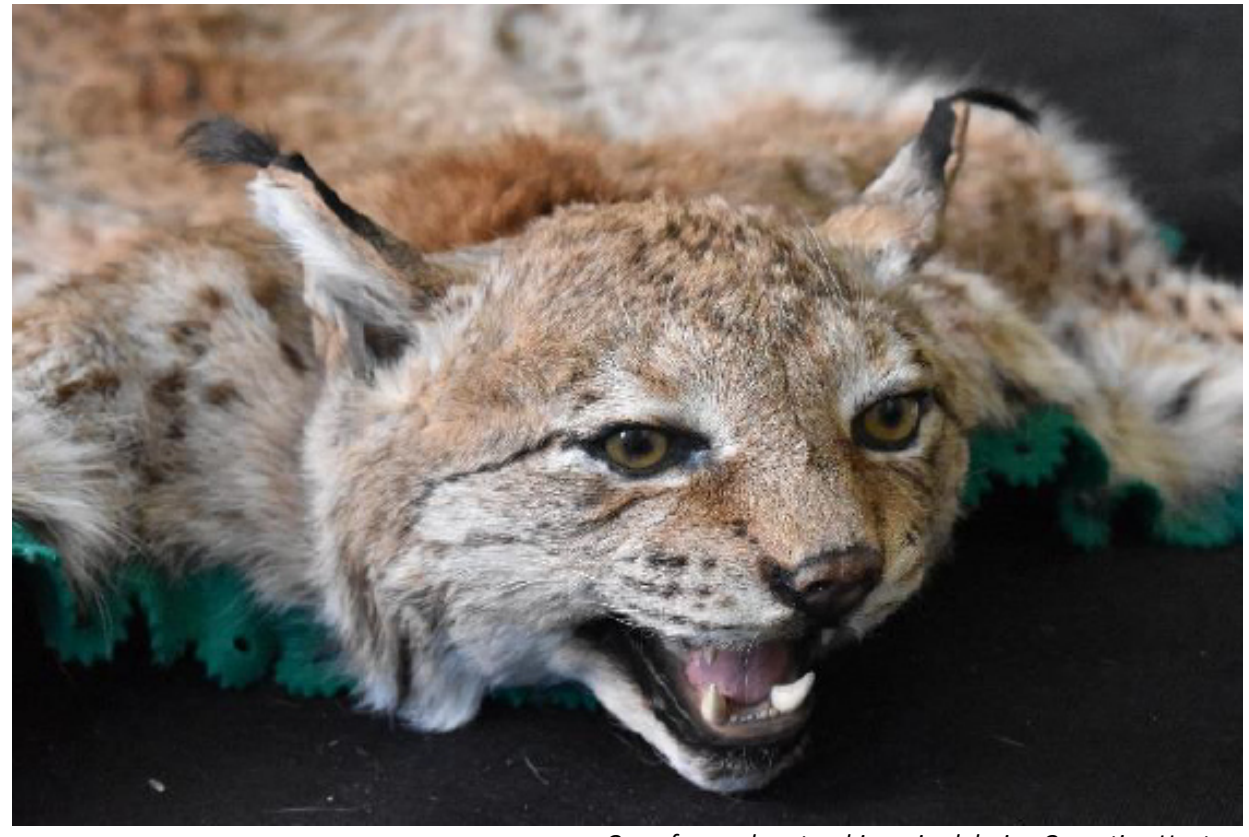
One of many lynx trophies seized during Operation Hunter

The action ends early the next morning. Everybody is totally exhausted after many hours of work. Customs officers seized 246 specimens of protected species. Partly these were frozen bodies, their parts, meat or claws; some were already processed in the form of stuffed animals, tanned skins or bleached skulls. A truck had to be used to transport the seized evidence. Some of the specimens were returned after verification so the final number of confiscated specimens eventually stabilized at 204.