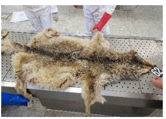
Examination of seized wolf skin

The change went through all the readings in Parliament and Senate, and nobody was taken aback by it, nobody found it problematic. Possibly because when it was discussed, nothing was publicly known about Operation Hunter. How will it be recognized if the animal was killed, for example, in Sweden, and not in Czech mountains? That's the question.