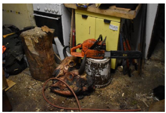
American or European Bison, photo called "Chain Saw Massacre"

The house has two floors and an attic, and practically everywhere we look are the remains of animals. Apart from a few residential rooms the house is full of dirt and stink. Layers of moulded animal skins are laying on the ground in corridors, piles of antlers, bones and other stuff inside of rooms. Buckets with weird liquids and semi-soaked "something" are all around. Skulls with dry meat are hanging on a wire on the walls. There are also 13 chest freezers here... Damn it, this will not be fast, and it will be a hard work.